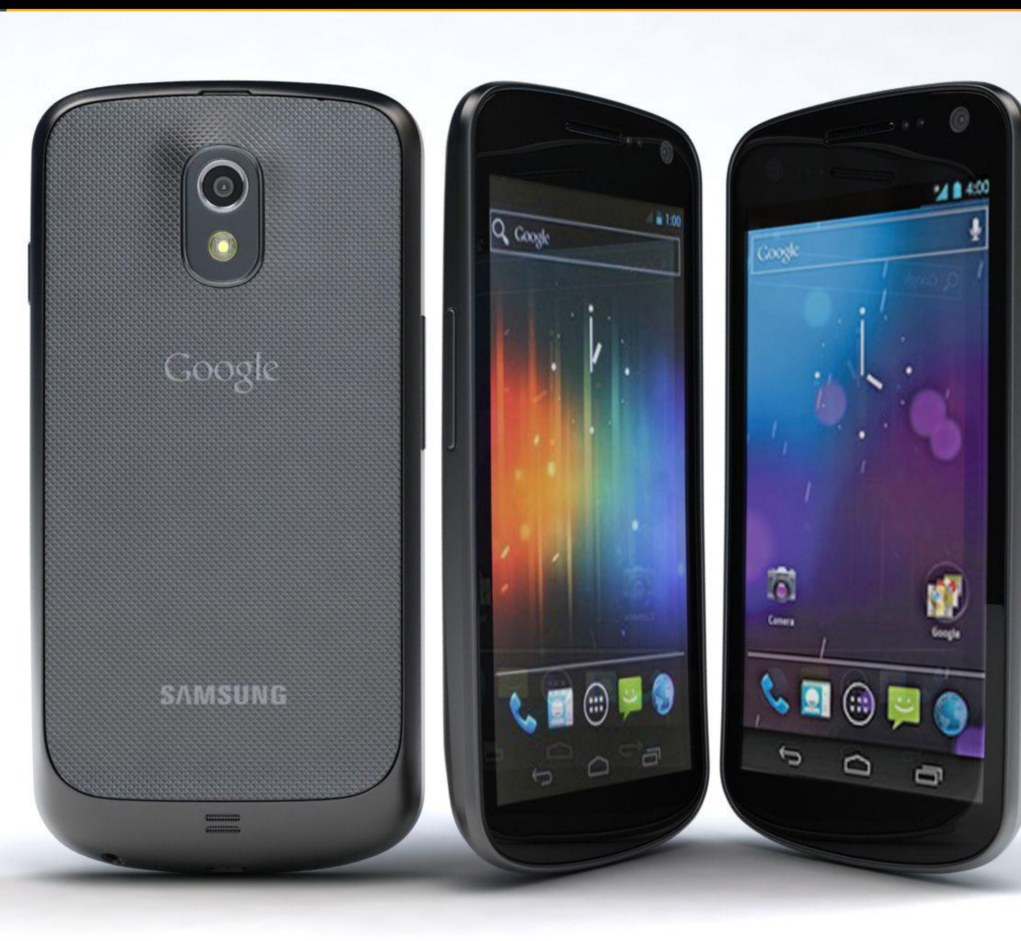
Samsung Galaxy Nexus