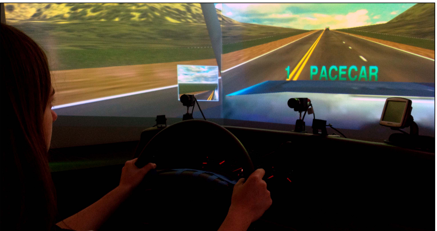
Fig. 1: A 'Wizard of Oz' confederate in Pod 1 closes in on an unsuspecting participant. The Real-time Multiple Seat Simulator (RMSS, pronounced 'rims') at The University of Central Florida allows multiple drivers to interact in one environment.

As straightforward as use cases for ITS technology seem, complications abound. Regulators must decide what